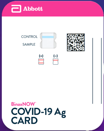
COVID-19 TEST NAVICA MOBILE APP