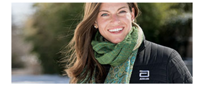
Chronic Pain, Tremors & Parkinson's