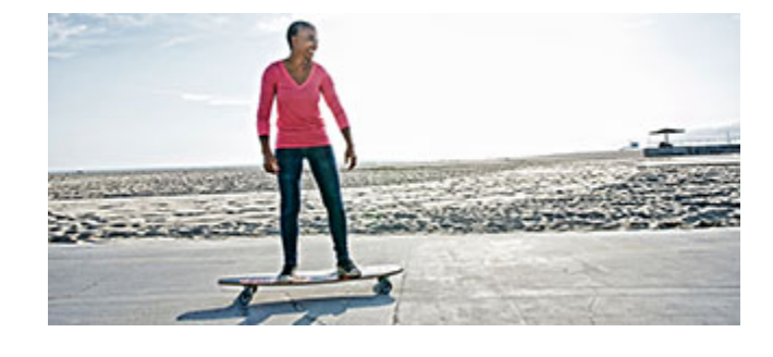
Health & Wellness