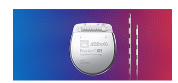
Chronic Pain, Tremors & Parkinson's